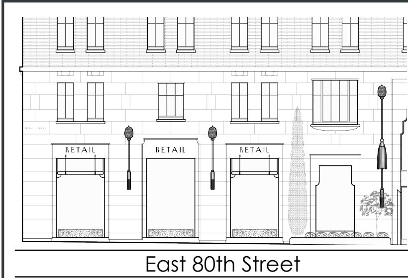
East 80th Street